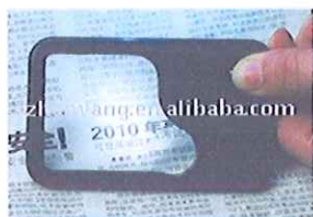
Good Quality+Cheap Price PVC material LED Magnifier