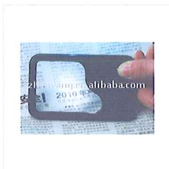
See larger image: Good Quality+Cheap Price PVC material LED Magnifier