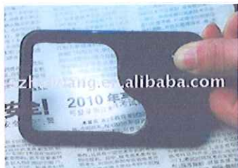
LED card magnifier