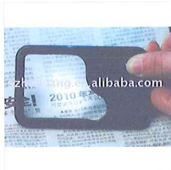
See larger image: LED card magnifier