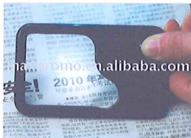
M-C013 LED magnifier