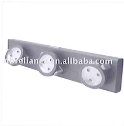
See larger image: 9LED swivel head cabinet light

FOB Price: Get Latest Price Place of Origin: Zhejiang China (Mainland) Model Number: RP-710 Color: BLACK Input Voltage: Other Port: shanghai or ningbo Payment Terms: L/C,T/T