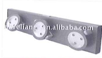
9LED swivel head cabinet light