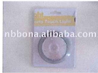
LED Touch Light