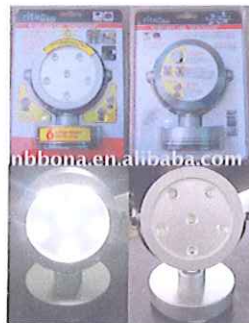
WIRELESS LED SPOTLIGHT