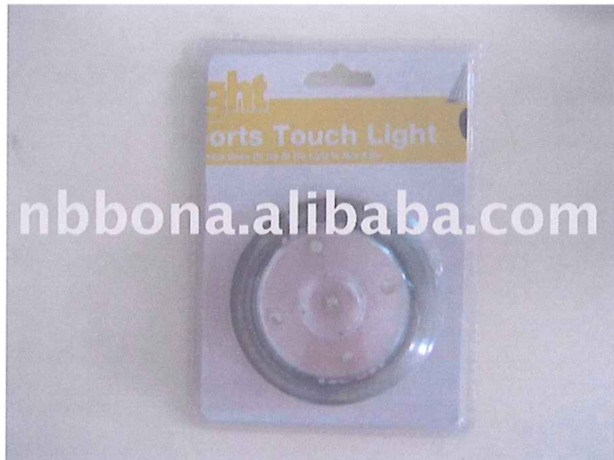
LED Touch Light