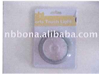
LED Touch Light