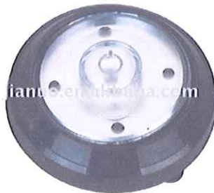
LED touch light