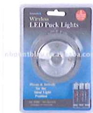
5 led push light