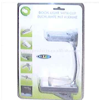
See larger image: LED Book Light