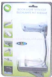
LED Book Light